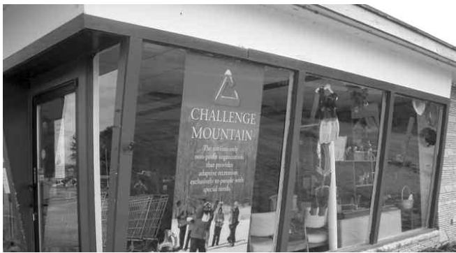
Challenge Mountain Resale Shops, located in Boyne City and Petoskey, offer a wide range of donated clothing and household items for sale with proceeds utilized to help support Challenge Mountains' ongoing mission.