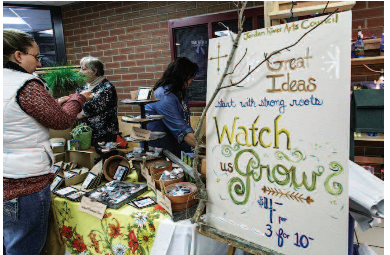
JRAC booth at the Holiday Art Fair, EJHS, Saturday November 8. "Great Ideas start with strong roots. Watch us grow."

note for sale were the caramel apples donated by Kilwins of Charlevoix. The gourmet lunch is always a big hit with plans already started for next year.