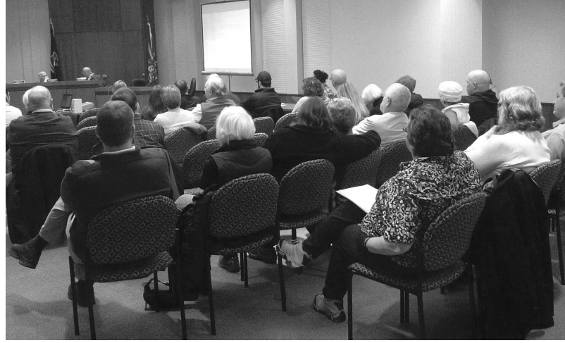
A large crowd gathered at City Council learned of how council members intend to unify the city with neighboring townships.