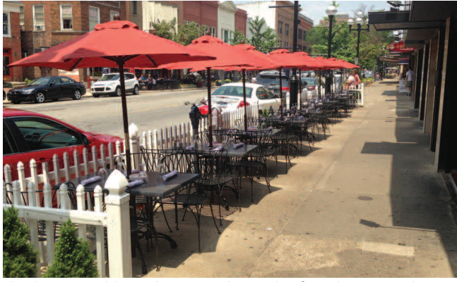
Charlevoix could see dining similar to this found in Ann Arbor as early as this summer.

These changes were made at the request of various council members