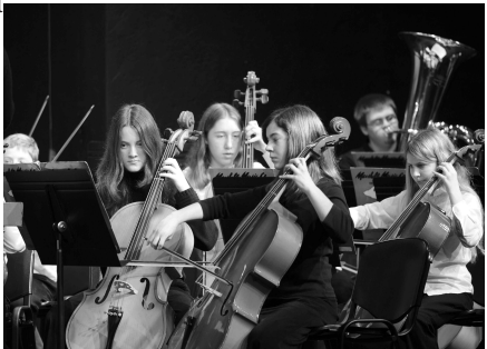
Crooked Tree Arts Center Youth Orchestra students intent during performance.